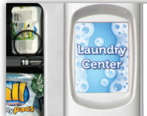
Changeable back lighted point of sale window for advertising and specials.