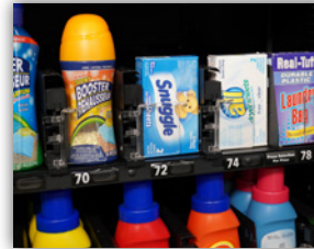
Push-It Tray Delivery System

7 inch full-color touch screen provides customers with a shopping cart purchase experience including product calorie information and video ad capability.