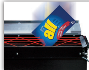
iVend® Guaranteed Delivery System

Includes standard electronic coin acceptor and $1, $5, $10 & $20 bill acceptor (Set for $1 & $5)