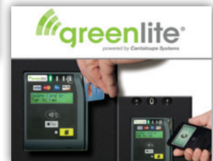
Credit/Debit & mobile reader options.

Keeps customers satisfied and reduces service calls for misloaded product.