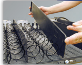
Re-configureable coil trays.

In order to bring you the best products possible, we continue to improve product design and performance and as such specifications are subject to change without notice. The manufacturer makes no warranties or representations of compliance with any local, state, national or international requirements for the operation of the equipment in any application for which it is capable of being used beyond approvals listed on the product. Any purchaser is required to make an independent analysis of the fitness and legality of the product's usage before it is deployed and must continue to monitor the potential changing nature of compliance requirements. The manufacturer expressly disclaims responsibility for compliance with any laws and affirmatively requires any buyer to make an independent analysis of the fitness and legal basis of any use or application of the subject unit.