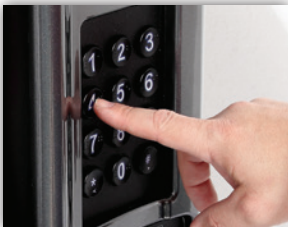
Large Keypad with Braille Identified Keys Friendly to the touch and easy to use by sight impaired customers.