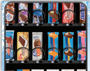
Vends all types of frozen products.