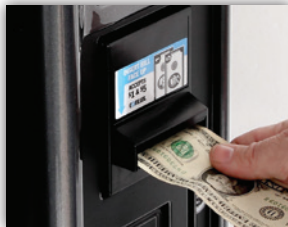
Premium Currency Acceptors Includes standard electronic coin acceptor and $1, $5, $10 & $20 bill acceptor.