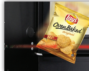
iVend® Guaranteed Delivery System

Keeps customers satisfied and reduces service calls for misloaded product.