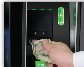
Premium Currency Acceptors

Keep your customers happy by with all their favorite chips, crackers, cookies, candy & confections.