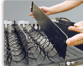
Re-configure trays to almost any package size in the field with no need for tools.