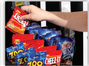
Dispenses All Brand Name Products

Keeps customers satisfied and reduces service calls for misloaded product.