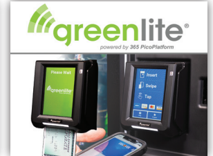
Credit/Debit & mobile reader options.