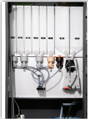
State-Of-The-Art Brewing System Simple brewing system and filtering ensure a high quality, consistent drink (No Filter Paper Required)