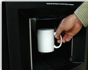
Own Cup Feature Use your own cup. Vendor automatically senses when you've placed your cup in the vend area.