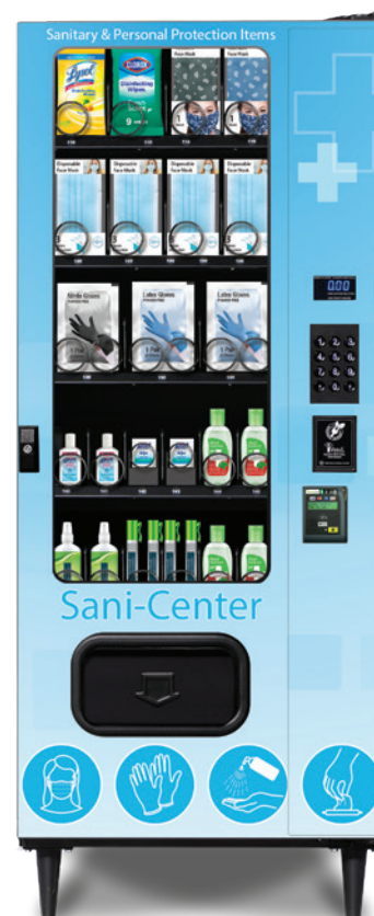
Sani-Center PPE Vending Machine