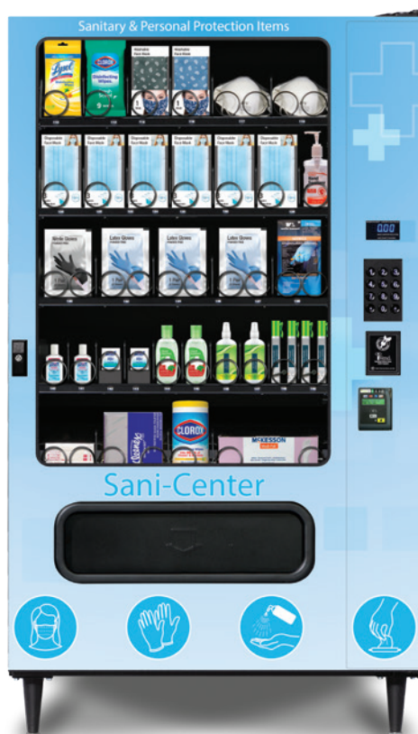
Sani-Center Plus PPE Vending Machine