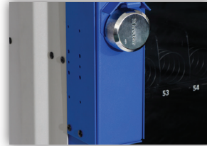
New upgraded lock and hasp.