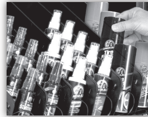
Easy first-in-first-out loading!