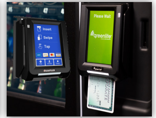
Greenlite Cashless System option accepts credit/debit cards and mobile wallets.