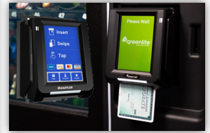
Greenlite Cashless System option accepts credit/debit cards and mobile wallets.