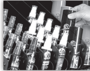
Easy first-in-first-out loading!