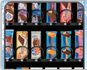
Vends all types of frozen products.