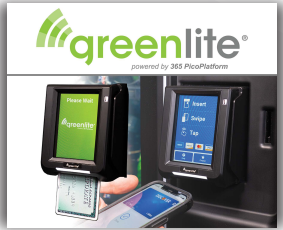
Credit/Debit & mobile reader options.