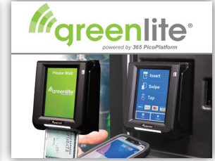
Credit/Debit & mobile reader options.