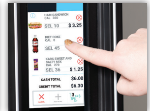
Optional Touch Screen Interface 7 inch full-color capacitive touch screen provides customers with a shopping cart purchase experience including product calorie information.*