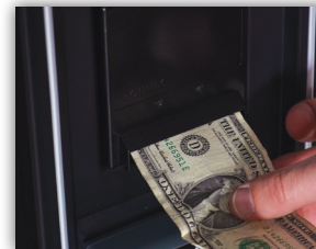
Premium Currency Acceptors Includes standard electronic coin acceptor and $1, $5, $10 & $20 bill acceptor (Set for $1 & $5)