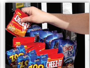
Dispenses All Brand Name Products

Keeps customers satisfied and reduces service calls for misloaded product.