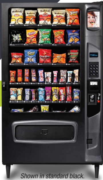
Shown in standard black.