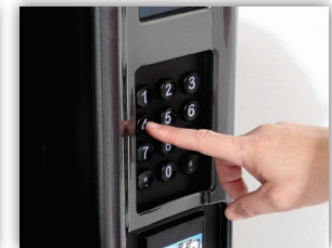
Large and easy to read selection buttons with Braille identification.