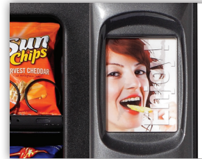
Back lighted point of sale window for advertising and specials.