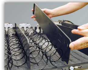
Re-configure trays to almost any package size in the field with no need for tools.

In order to bring you the best products possible, we continue to improve product design and performance and as such specifications are subject to change without notice. The manufacturer makes no warranties or representations of compliance with any local, state, national or international requirements for the operation of the equipment in any application for which it is capable of being used beyond approvals listed on the product. Any purchaser is required to make an independent analysis of the fitness and legality of the product's usage before it is deployed and must continue to monitor the potential changing nature of compliance requirements. The manufacturer expressly disclaims responsibility for compliance with any laws and affirmatively requires any buyer to make an independent analysis of the fitness and legal basis of any use or application of the subject unit.