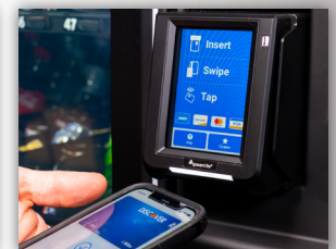
Credit/Debit card reader options.