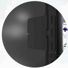
*optional insight lock

Energy efficient, eco-friendly HC refrigerant with low charge, spark-free components, and the lowest utility costs in its category.